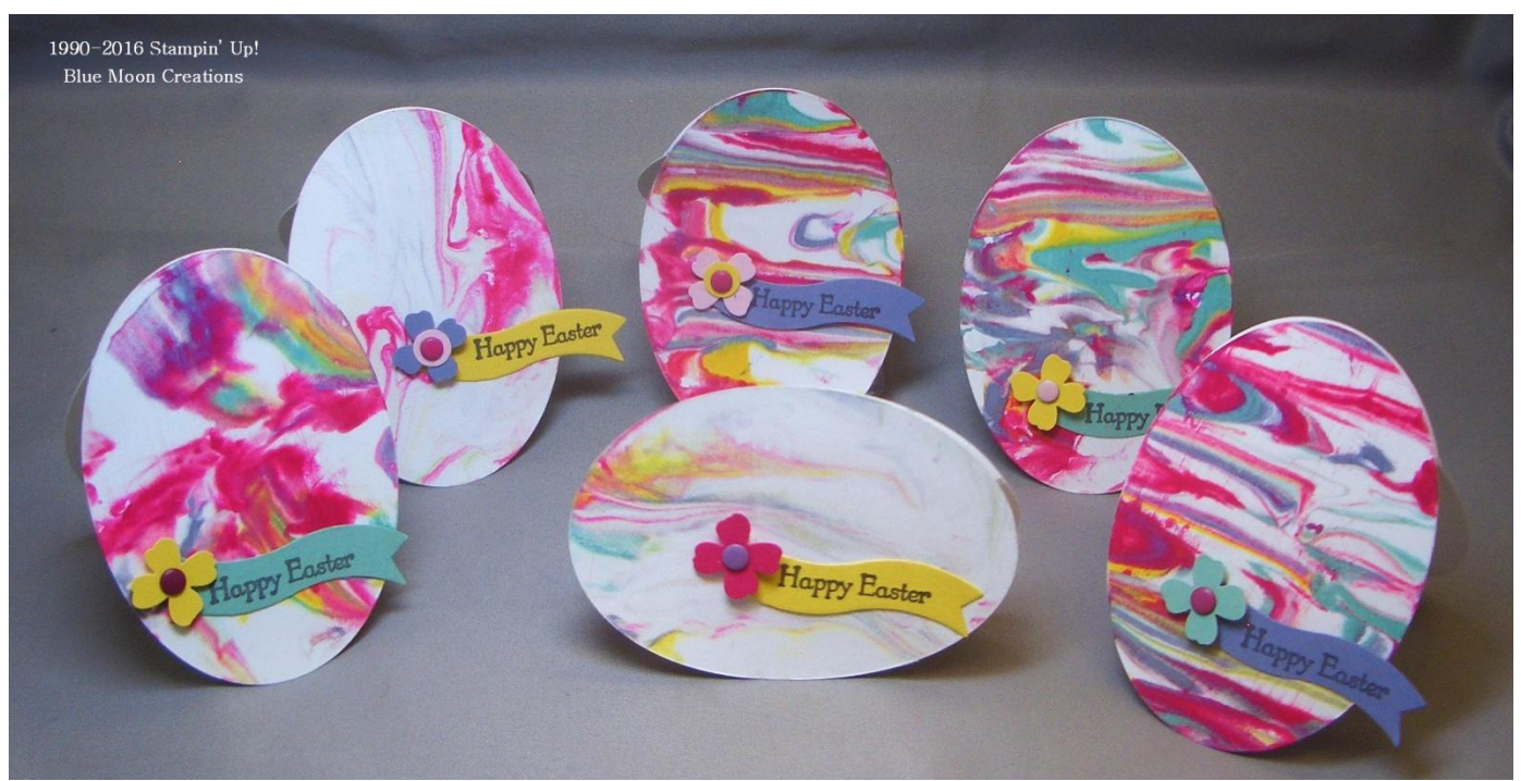
Shaving Cream Easter Eggs