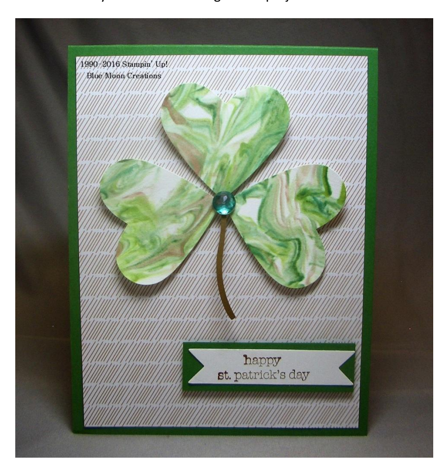
Happy St. Patrick's Day Shaving Cream Shamrock.