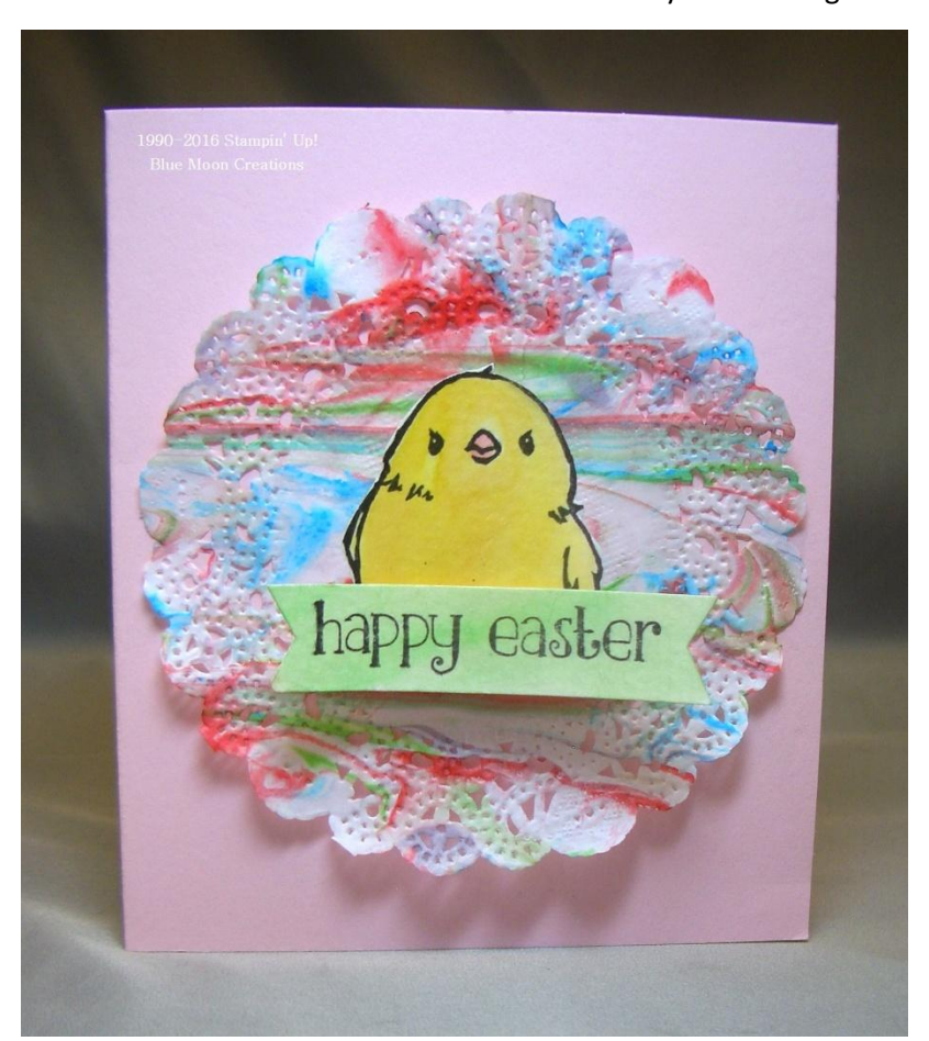
Easter Check shaving cream doily