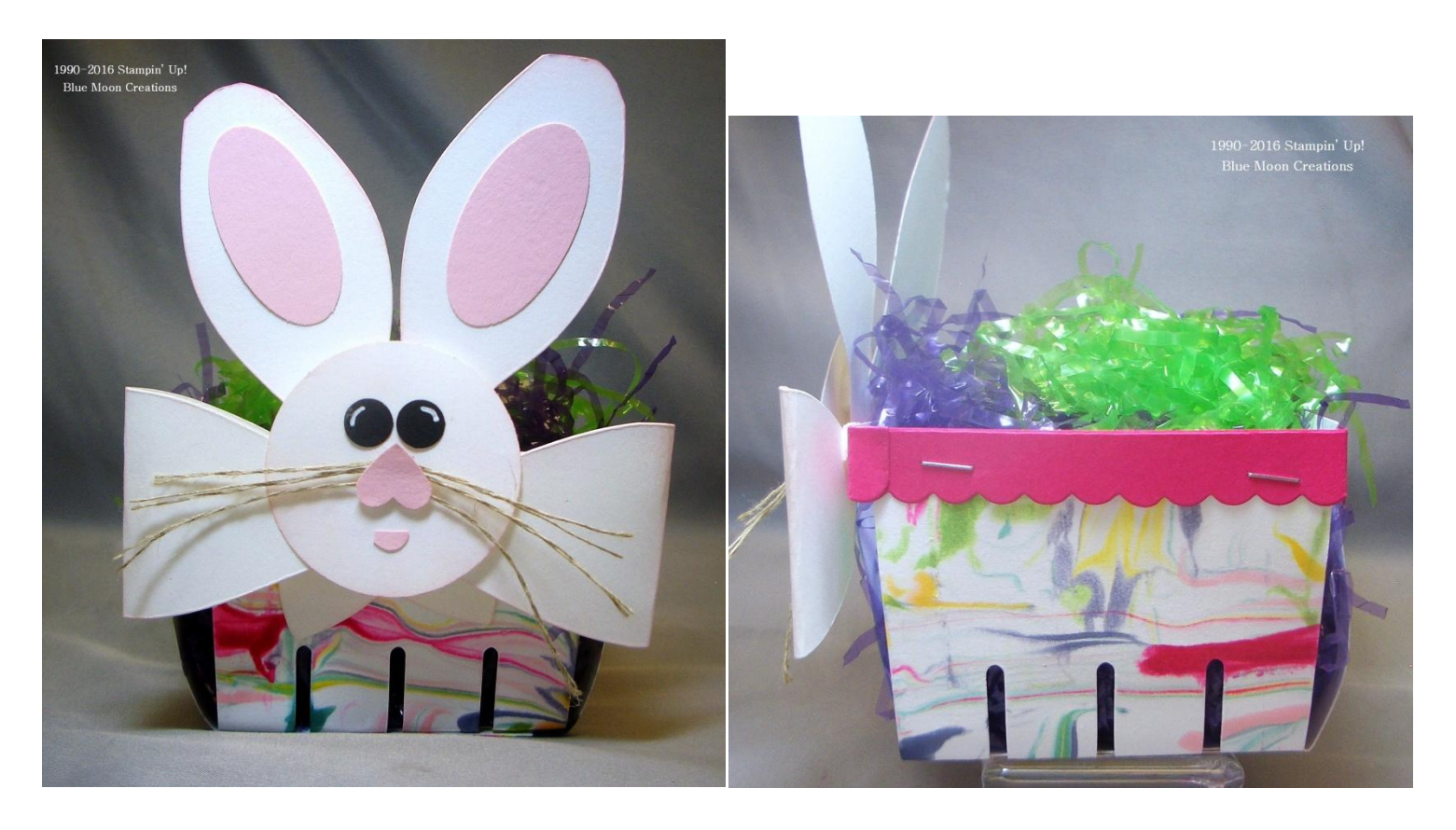
Easter Bunny in a shaving cream berry basket.