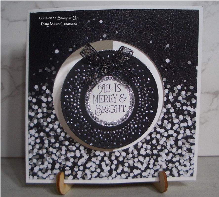
Silver Confetti 6" x 6" Swing Fold Card