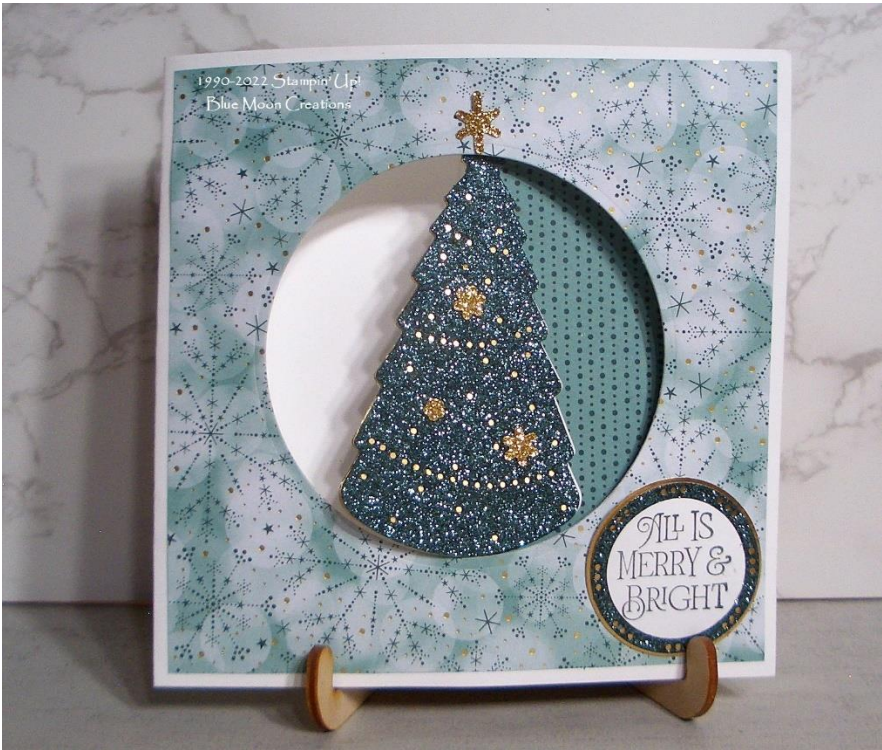
Christmas Tree 6"x6" Swing Fold Card